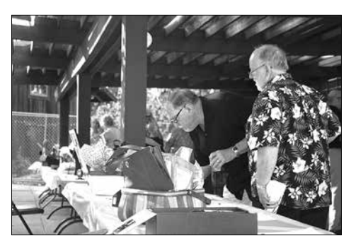
Perusing silent auction items from generous donors