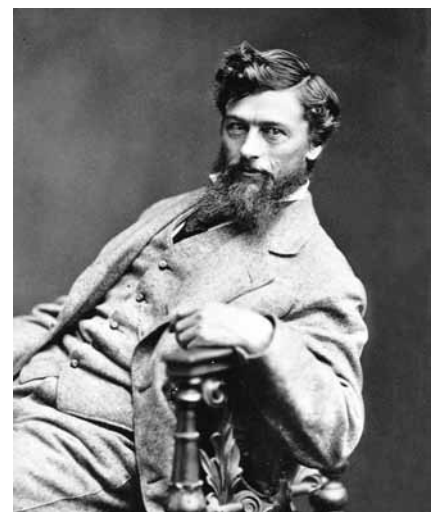
William Keith, ca 1870.

Don't miss the exhibit currently on display in our main gallery. A selection of 53 paintings that pays tribute to early California landscape master William Keith (1838-1911), it comes from the collection of Saint Mary's College of California. Keith's influences included the French Barbizon School and American artist George Inness. The exhibit is organized and circulated by Saint Mary's College Museum of Art in Moraga, and will be on display through January 27, 2013.