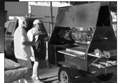
Right: Watching the Magruder Ranch pig roast.