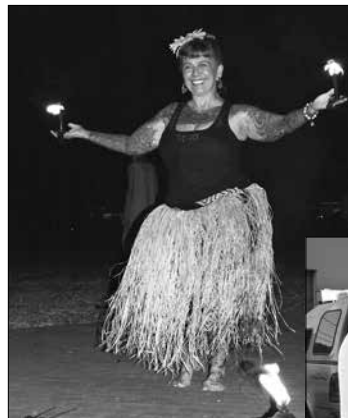
Left: After dark, entertainment was provided by the Wildfire Dancers.