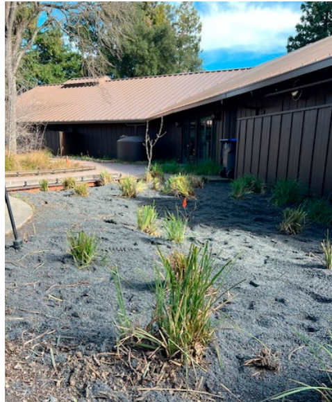
The main sedge bed after the thinning.

Recently, the Wild Gardens was fortunate to get some help from the California Conservation Corp (CCC). Four CCC members volunteered for two days to thin out the main sedge bed. White root sedge, Carex barbarae , is an important plant used in Pomo basket making. When harvested, their long white rhizomes are stripped, split, cured, and then used as the sewing strand in coiled baskets. Rhizomes are the