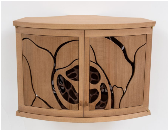
Layered Space , madrone cabinet by Austin Schuler

On March 30, we will open a new special exhibition, Deep Roots, Spreading Branches: Fine Woodworking of the Krenov School , with an opening reception following on Friday evening, April 5. You will be able to admire and look carefully at cabinets and chairs, crafted meticulously by former students and instructors of the Krenov School of Fine Furniture in Ft. Bragg. You'll be able to feel the buttery smoothness of opening a finely-made drawer. You'll be able to hear the stories and