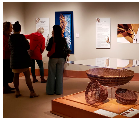
Museum visitors enjoy The Curious World of Seaweed at the opening reception.

At our February First Friday we celebrated the opening of the Museum's current exhibition, The Curious World of Seaweed , with a reception that included photographer Josie Iselin, who created the show in collaboration with Exhibit Envoy. Josie's images enchanted visitors. The addition of related pieces by local artists includ-