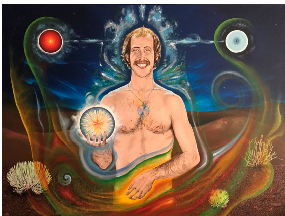
Naked Honesty, 1976, by Doug Volz