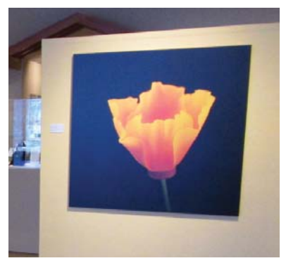
Beauty and the Beast: California Wildflowers and Climate Change is now on display through June 17.