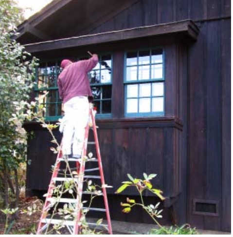
Refreshing the trim on the Sun House windows.

Sun House recently received a fresh coat of Total Wood Protection (TWP), a stain that safeguards against water damage, UV light, mold and mildew, and wood rot, and also brings out the beauty of the wood. Our thanks to Dunn Right Painting and Kelly-Moore Paints for their respective donations of time and TWP. The next phase is underway as we work on a plan to beautify the landscap-