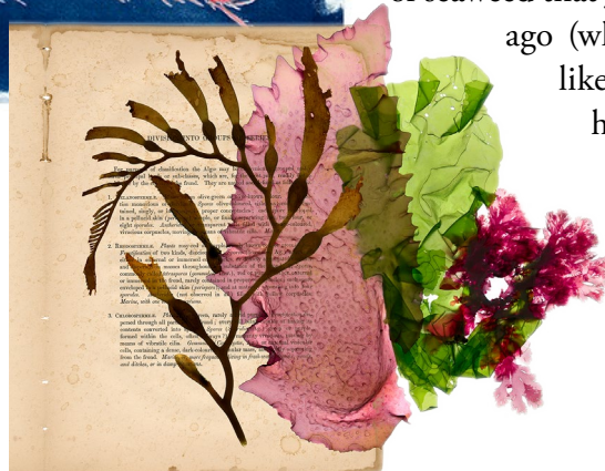
Right: Three Color Group , by Josie Iselin; archival digital print (courtesy of Exhibit Envoy)