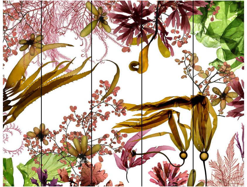
Oceans Edge I , by Josie Iselin; photographic mural

In our upcoming exhibition, organized and traveled by Exhibit Envoy, visitors will get to explore this rich and incredibly important ecosystem. Running from January 29 to April 30, 2023, The Curious World of Seaweed was created by Josie Iselin, a photographer, author, and book designer. It is based on her publication of the same name. The exhibition looks at the science of seaweed and its human