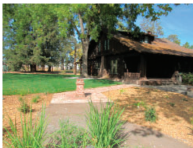
New plantings in front of the Sun House