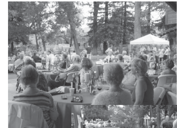
A night to remember: the 30th Anniversary Gala.